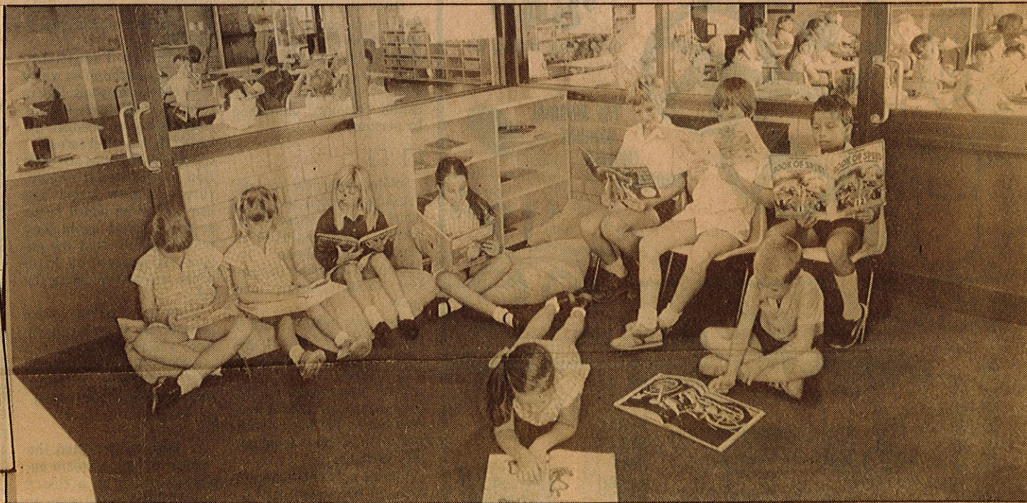
RELAXING in free time . . . students enjoy reading in the withdrawal room while class work continues uninterrupted.