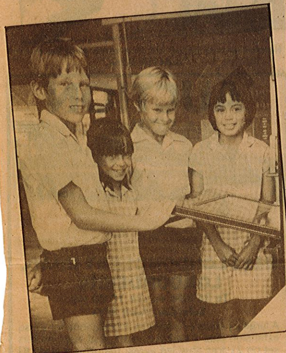
STUDENTS inspect part of the school's modern kitchen.